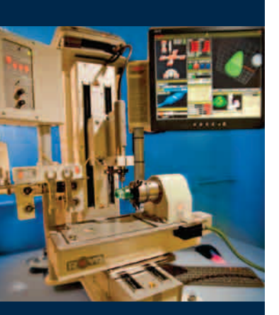
Revo Mill by Gemvision