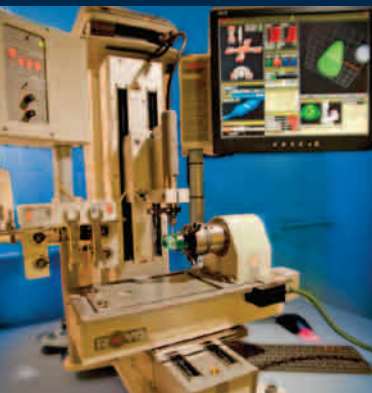
Revvo Mill by Gemvision